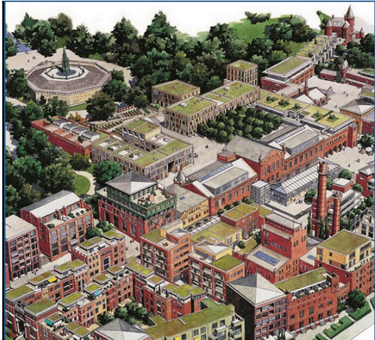
Viktoria Quartier, Berlin (historic brewery) (520 apartments)

Purchase, Development/ Conversion, Construction, PR, Marketing (1998 – 2004) Project volume: € 350M