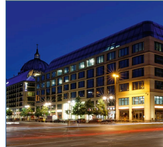
Dom Aquaree, Berlin (approx. 68,000 sqm effective space)

PR during development and construction (2006 – 2010) Project volume: € 56M