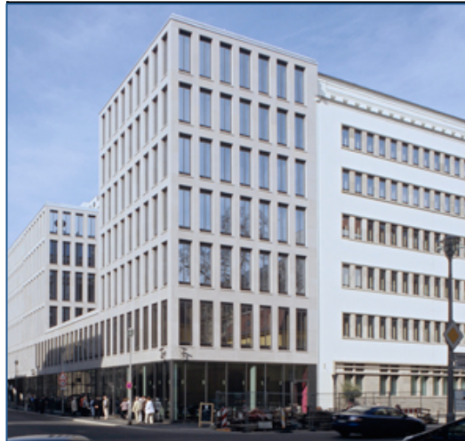
German Federal Ministry for Family Affairs, Berlin (approx. 8,300 sqm office space)

Purchase, Development/ Conversion, Construction, PR, Marketing (1998 – 2004) Project volume: € 350M